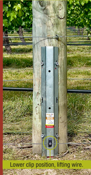
Lower clip position, lifting wire.