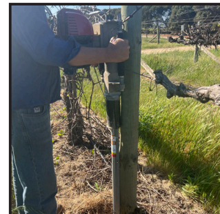
Ocloc V-NZ - ramming