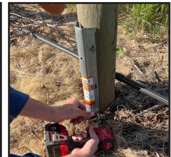
Ocloc V-NZ - screwing

Ocloc products are carbon neutral — 100% carbon offset —